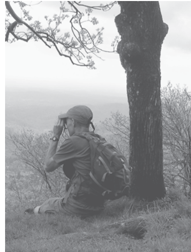
Checking out the view from Ball Mountain cliff.