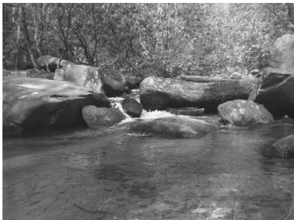
Reedy Cove Creek runs along Twin Falls Trail.

T win Falls, located at the head of the Eastatoee Creek Gorge, is also known locally as Reedy Cove Falls, Rock Falls, and Eastatoee Falls.